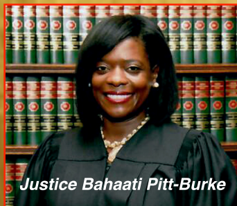
Justice Bahaati Pitt-Burke