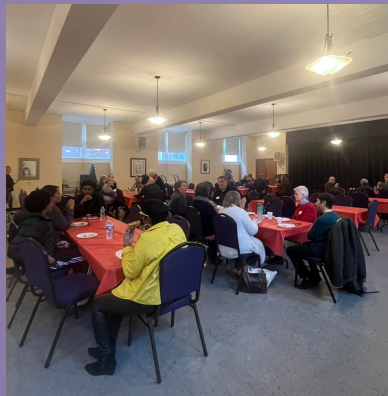
Attendees at the Saturday event