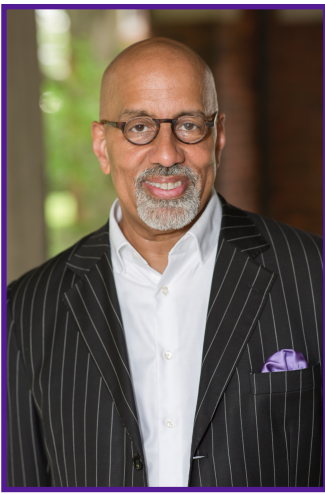
It's Up to Us!

grace and mercy with everyone we meet. As witnesses of the risen Savior, we have a part to play in building God's Kingdom. We must play an active role in spreading the message of salvation to those who have yet to embrace and be embraced by the knowledge of God in Jesus Christ. Now that we have celebrated the resurrection, it is up to us to seek God's guidance on what God would have us do to make his resurrection real for all.